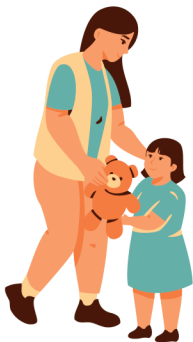
Keep Children Safe